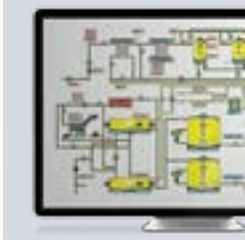
Efficient operations control