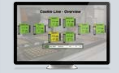
Important information at a glance at all times